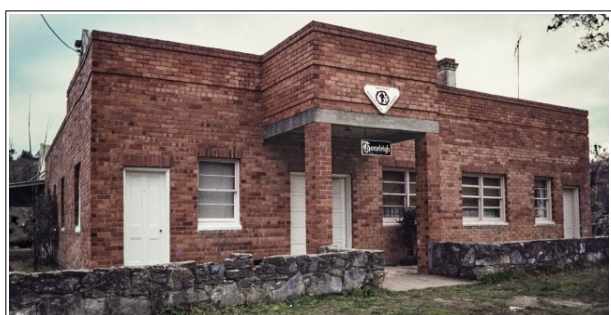
Homeleigh in the mid-1970s.

The Rimstone Co-operative was originally formed in 1974 to purchase the former Homeleigh guesthouse (built c.1885) at Buchan as a base for caving and speleological pursuits and its membership is largely, although not entirely, made up of cavers and speleologists.