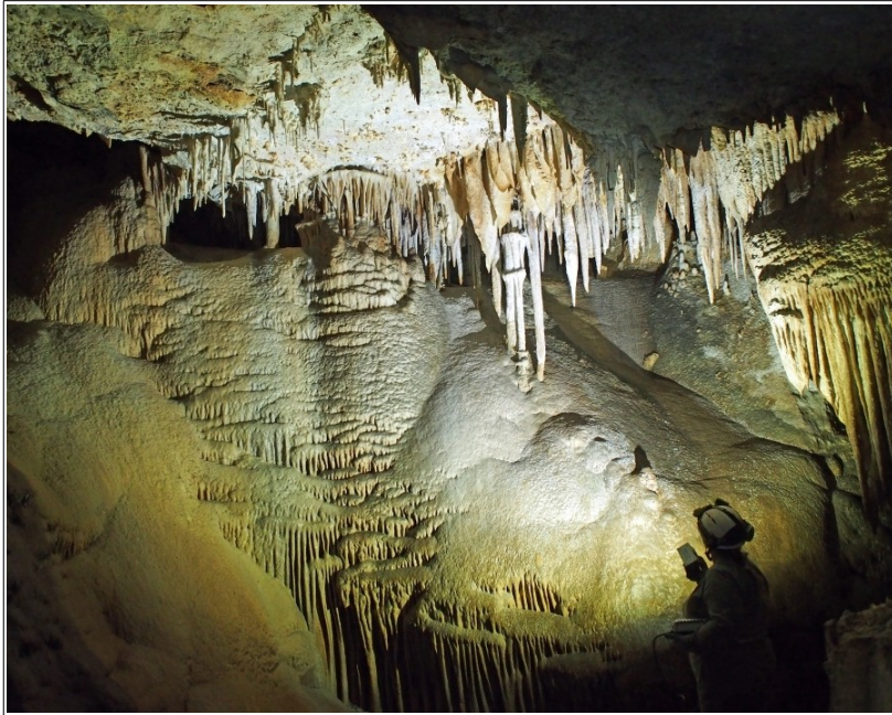
M-3 Cave — Spacious and very decorative