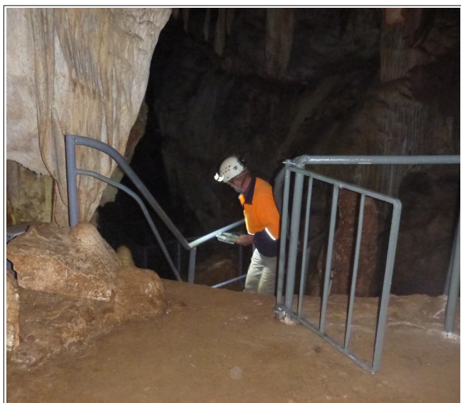
Daryl Carr painting the M-3 cave railings (2019)

Guided tours were conducted on weekends and public and school holidays by the leaseholders during the 1960s whilst improvements were progressively made to the infrastructure.