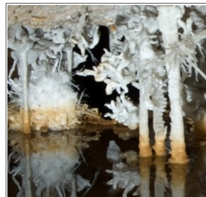
Photos: Examples of beautiful limestone formations in M-3.