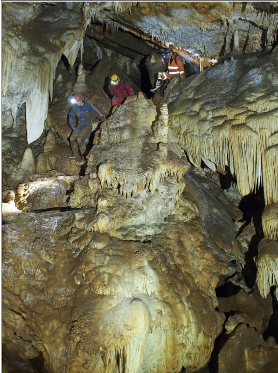
Caving party returning from a venture into the undeveloped far reaches of the cave (Daryl Carr)

In the longer term, a solar cell (PV) based low-voltage LED lamp replacement of the present electric lighting is a possibility.