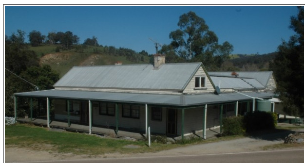
Homeleigh c.2015

The co-operative first ventured into ownership of cave and karst with its purchase in 2012 of the 42 hectare Scrubby Creek Cave property which contains a number of wild caves including the 'Scrubby Creek' active stream cave (M-49).